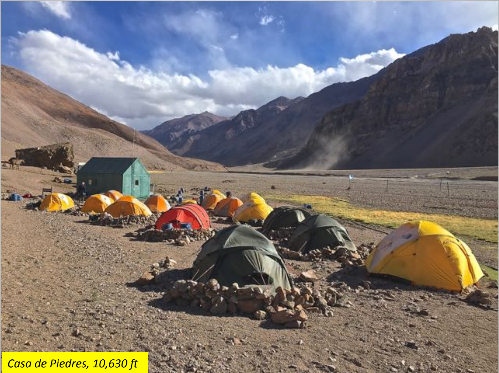
Casa de Piedres, 10,630 ft