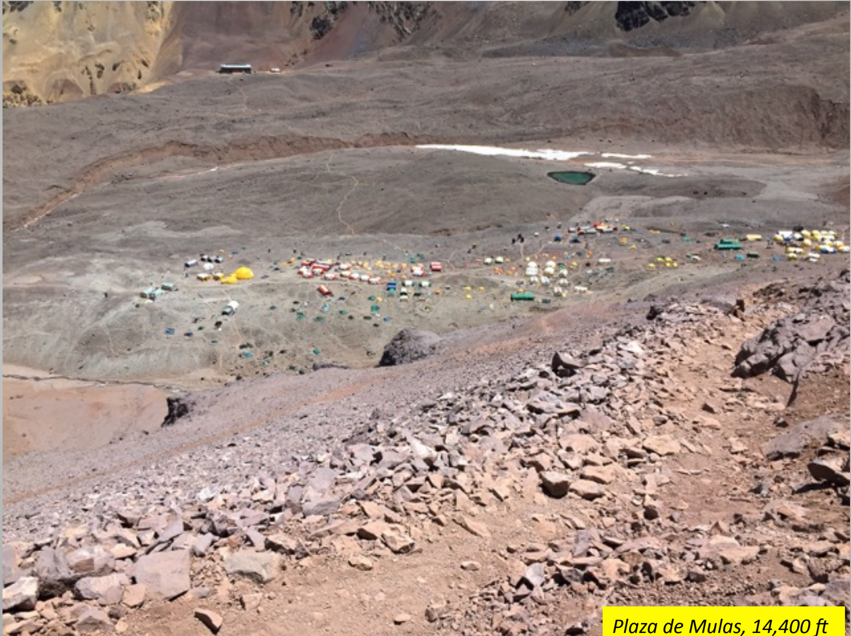
Plaza de Mulas, 14,400 ft