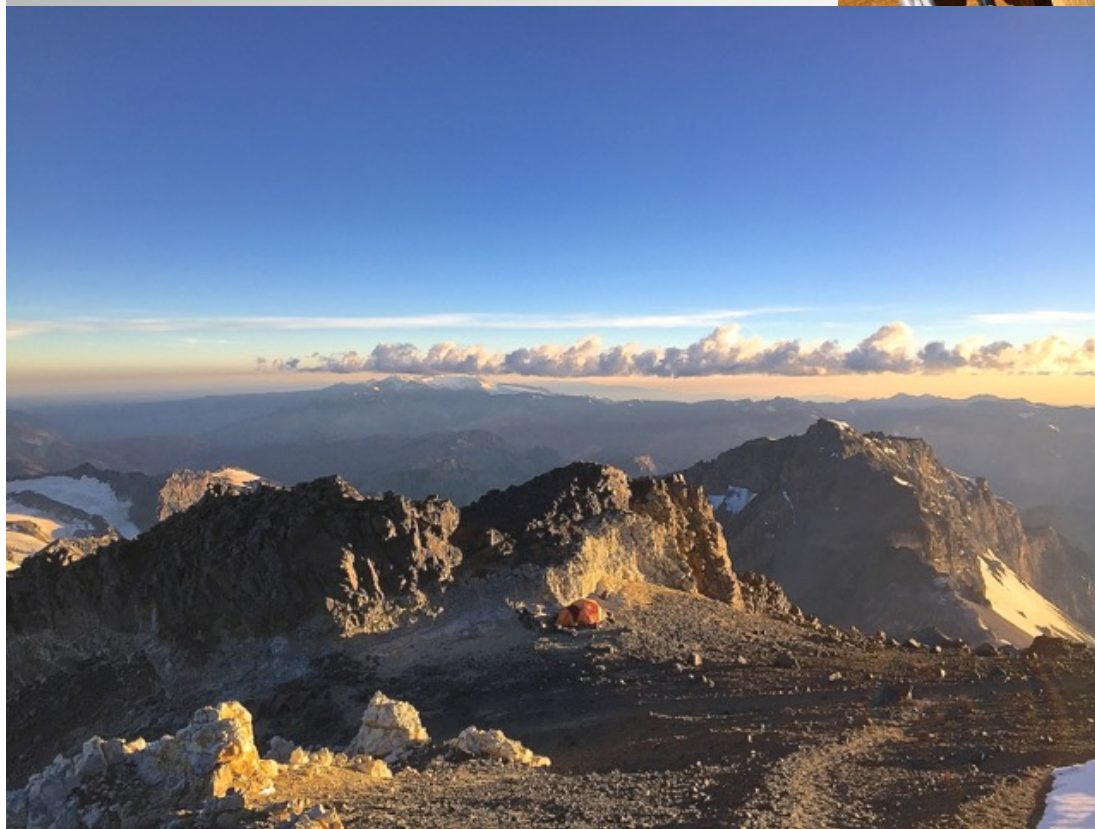
Independencia Hut, 21,400 ft