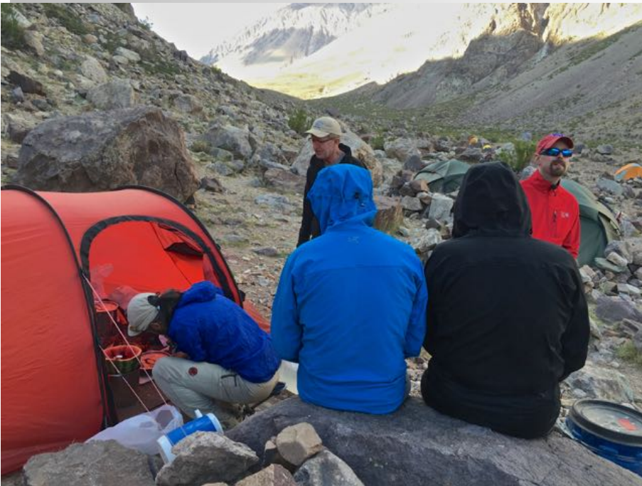
Waiting for dinner