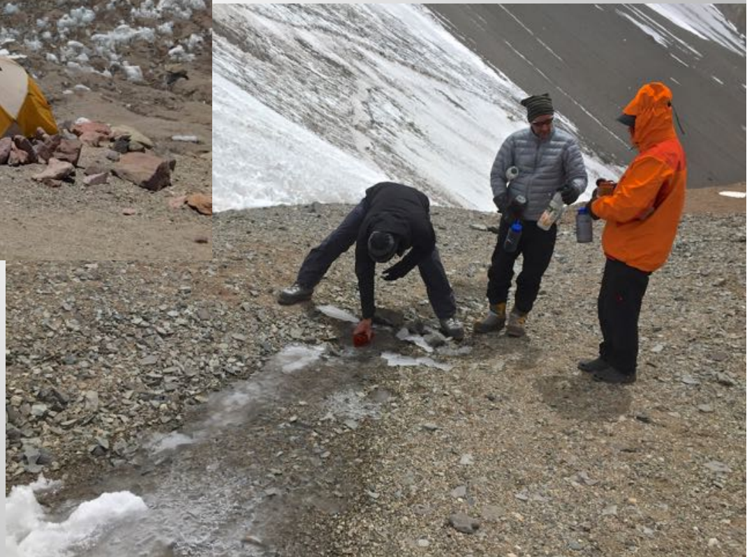
Camp 1 - 16,404 ft