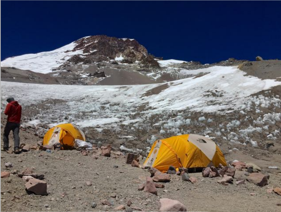
Camp 2 – 18,404 ft