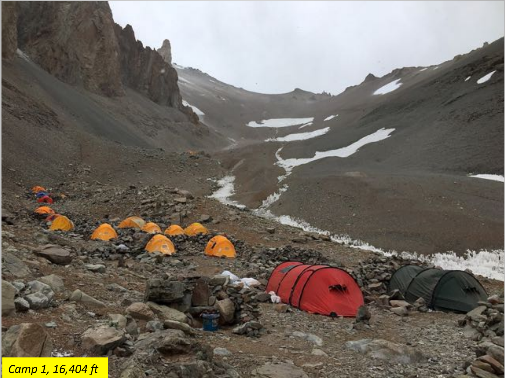
Camp 1, 16,404 ft