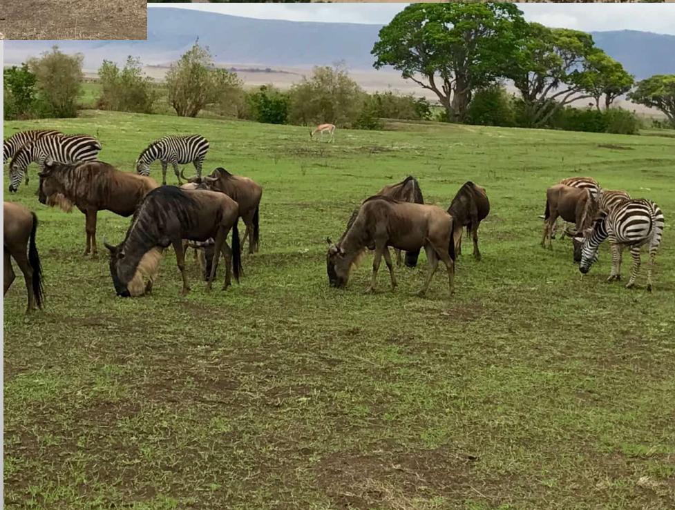
Zebra & Wildebeest