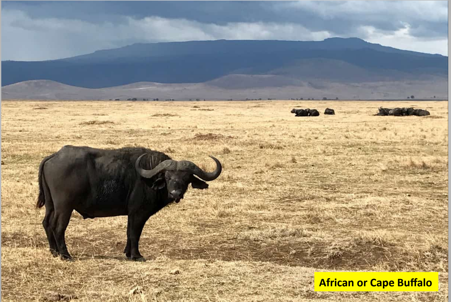
African or Cape Buffalo